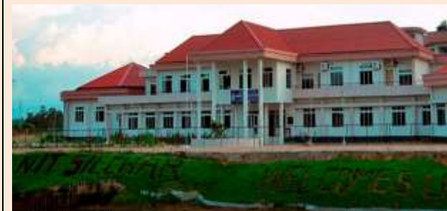
Department of Mechanical Engineering